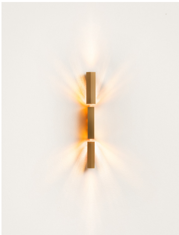
Tetra Twin Lamp