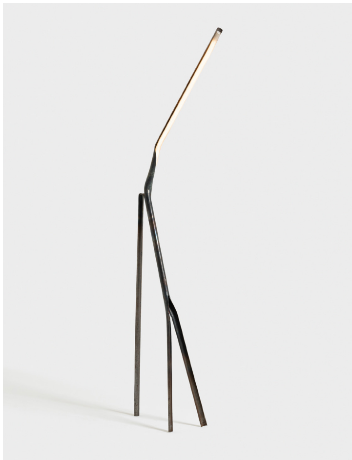
Ignis, floor light