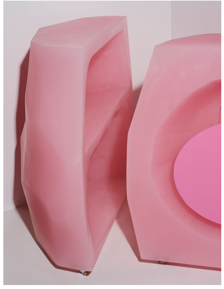
The Holy Mountain, cabinet bar