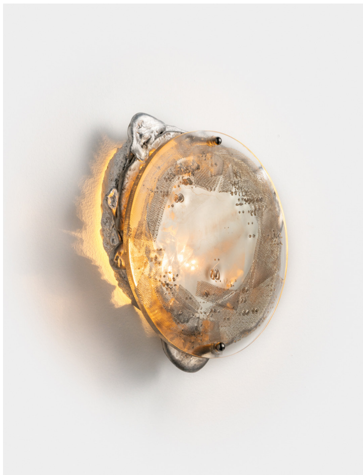
Opia Lamp // 1